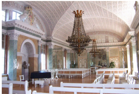
Bach Hall at Köthen Castle